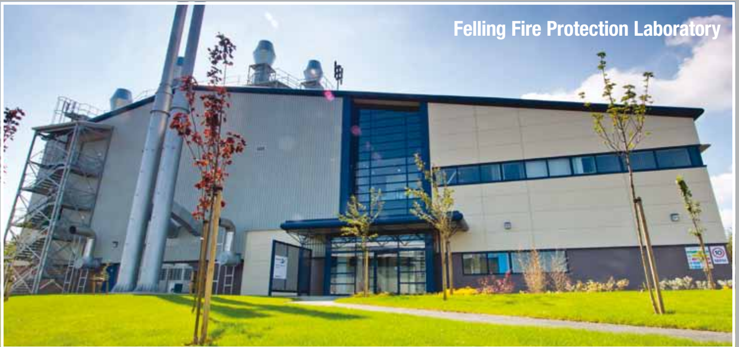
Felling Fire Protection Laboratory

Fire protection materials are safety critical products, their primary function is to protect lives and assets. We believe having our own fire testing facilities to carry out research and development is an absolute necessity.